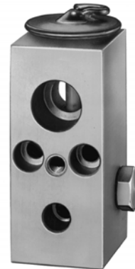
H-Block Expansion Valve

Protect your investment by examining the Expansion Valve